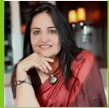
Sonal kalra , Hindustan times